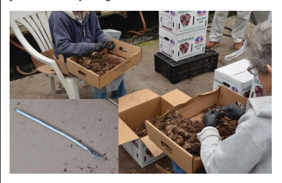
Figure 3. The terminal bud of these tubers is being removed (de-eyed) with a small scooping knife to encorage fuller and more uniform plants.

tures and should not be may exhibit apical domiplanted. If the tubers must nance over the basal buds and produce an unbalanced plant with one shoot that them at 70 °F (21 °C) on has large leaves and other shoots that are much smaller. In order to increase the number of axillary buds that emerge, growers will remove the apical, terminal or dominant bud in a etative buds or "eyes" that process referred to as "deeveing" or "scooping" with a small knife (Figure 3). Make sure to disinfect your knife periodically between tubers to avoid spreading diseases. De-eyeing should break apical dominance and tened segments connected cause the plant to be fuller, together. Multi-tubers have uniform, and have smaller leaves. Cultivars with solid and semi-solid tubers need