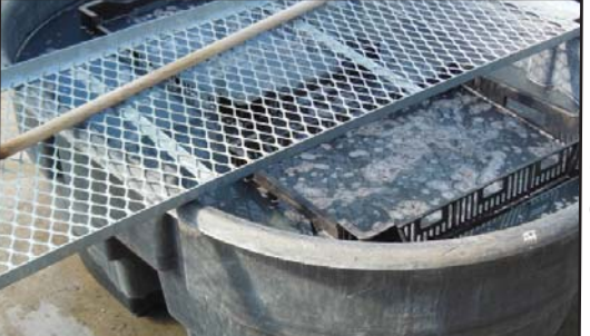
Figure 4 (left). Tubers are soaked in a fungicide prior to planting.

The goal is to maintain the substrate temperature at 73 to 75 °F (23 to 24 °C) with bottom heating (Figure 5). Faster emergence can occur at warmer substrate temperatures up to 85 °F (29 °C). Previous research has shown that irreversible tuber chilling injury can occur at 41 °F (5 °C). Up to three days of 50 °F (10 °C) was not detrimental; however up to 10 days at 50 to 61 ^{\circ} F (10 to 16 ^{\circ} C) delayed leaf emergence and reduced leaf number. Longer durations at temperatures below 63 °F (17 °C) can damage tubers and result in slow or no emergence (Figure 6), uneven and stunted growth (Figure 7), tuber rot, and greening of leaves upon