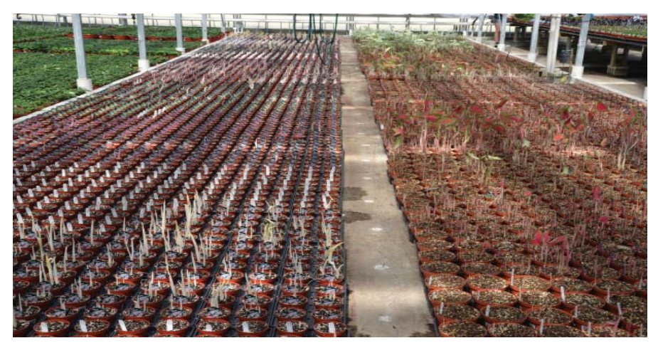
Figure 10. Plastic has been removed and shoots are emerging.