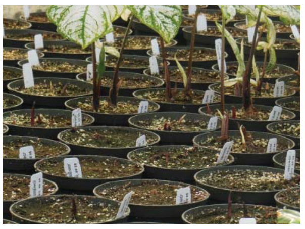
Figure 7. Uneven and slow emergence caused by suboptimal forcing temperatures.

Figure 8 (right and bottom). Use of plastic (clear, white and black) to increase temperatures and humidty to force caladium tubers in a greenhouse filled with other spring annuals.