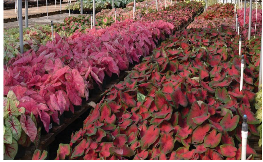
less than 65 °F (18 °C)] are Figure 11. Beautiful caladium crop that was initially maintained, forcing can forced under plastic. Photo was taken after 8 weeks of take from 8 to 12 weeks. forcing.