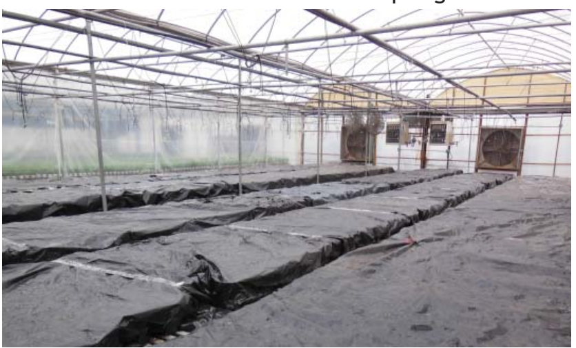
Figure 8 (right and bottom). Use of plastic (clear, white and black) to increase temperatures and humidty to force caladium tubers in a greenhouse filled with other spring annuals.