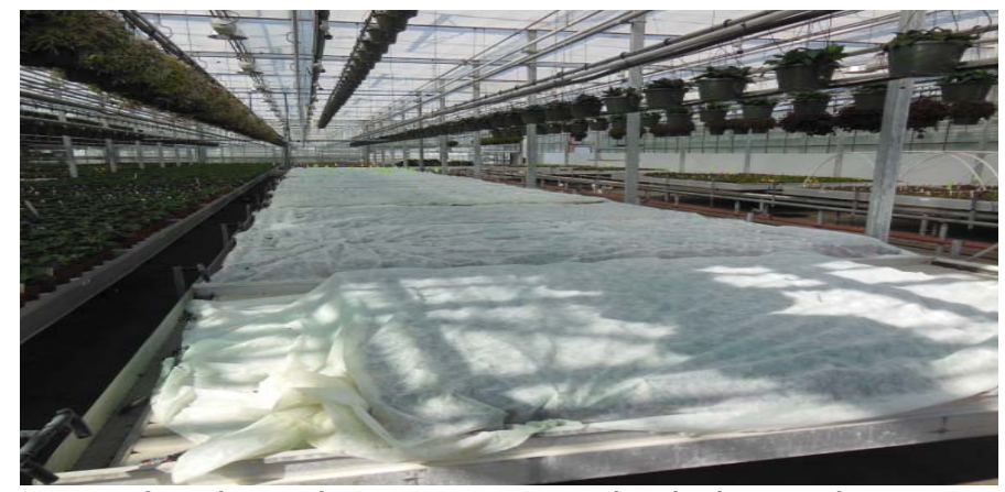
Figure 9. White plastic over potted caladium tubers.

If the above mentioned environmental and cultural conditions are maintained, caladiums can be forced in 4 to 8 weeks (Figure 11). If lower temperatures [not less than 65 °F (18 °C)] are maintained, forcing can forced utake from 8 to 12 weeks. forcing.