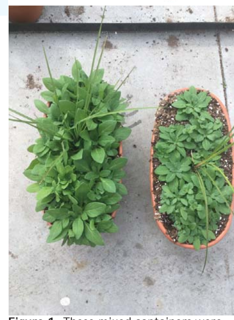
Figure 1. These mixed containers were grown in the same block of plants. While they were supposed to have been treated with the same plant growth retardant application, the container on the left did not receive the same treatment as the one on the right.