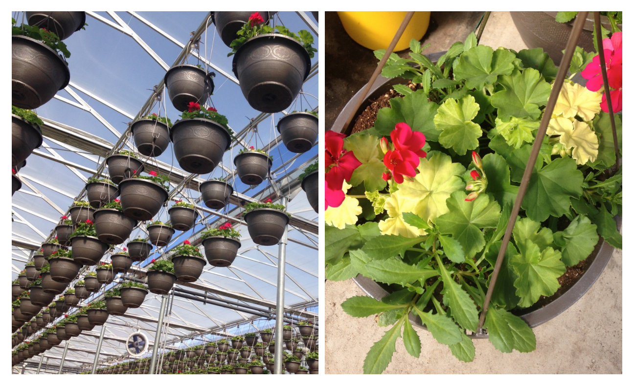
Figure 6. Heat stress on zonal geraniums baskets hung in the top row of a greenhouse.

as often as they should be on hot sunny days after a long cool, cloudy stretch of weather. The trapped heat caused those zonal geraniums that were grown in the top-most row to also exhibit bleaching and chlorosis of the leaves (Fig. 6). Growers should take into account the the outside temperatures, indoor setpoints, and the total light accumulated during the day (daily light integral) when venting greenhouses, especially when the weather rapidly shifts from cool and