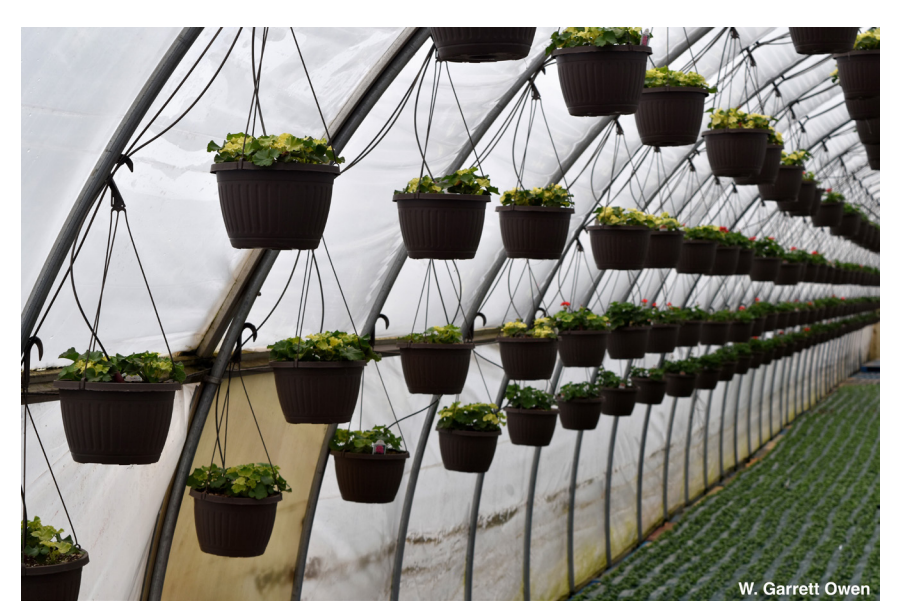
Figure 1. Hanging baskets of zonal geraniums suspended from the greenhouse bows.

While visiting two separate growers in Michigan, we were asked to look at a greenhouse section containing zonal geranium hanging baskets. The hanging baskets were suspended from the greenhouse bows (Fig. 1) and the geraniums were exhibiting bleached and chlorotic foliage (Fig. 2). At first, we thought we were observing a severe iron (Fe) or sulfur (S) deficiency or ethylene damage from a cracked heat exchanger, though the flower buds were not aborted. While discussing the crop's history, the primary heater (Fig. 3) came on and we figured out the answer to the grower's burning question.