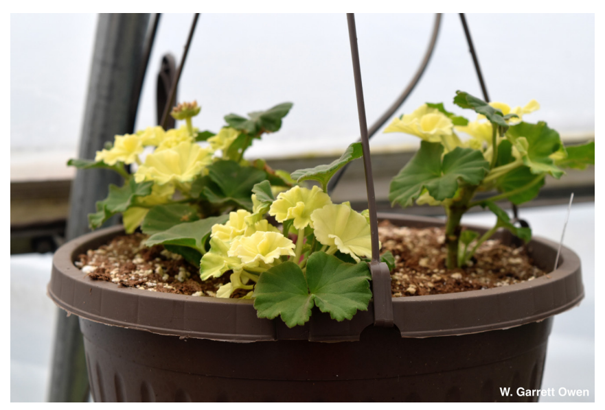
Figure 5. The first bow of zonal geraniums baskets exhibited the most intense bleaching of the foliage and necrosis of the developing flower.

The first bow of baskets exhibited the most intense bleaching of the foliage and necrosis of the developing flower (Fig. 5). When I examined the second bow of suspended plants, the intensity of bleaching lessened. Geraniums suspended from subsequent bows exhibited less chlorotic foliage and at a distance of 28 feet from the heater, plants did not exhibit any symptoms of heat stress.