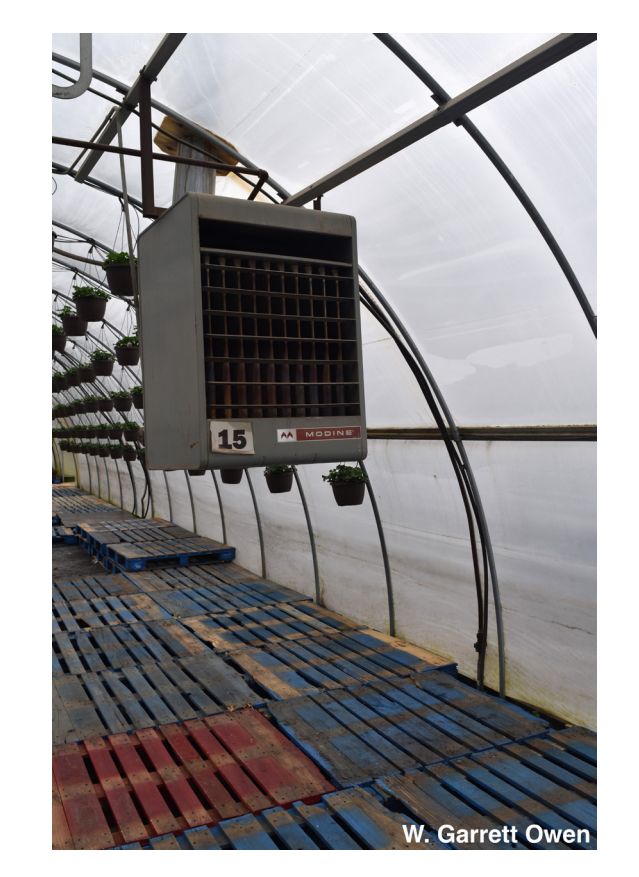
Figure 3. Primary heater used to heat the growing environment.

Where trade names, proprietary products, or specific equipment are listed, no discrimination is intended and no endorsement, guarantee or warranty is implied by the authors, universities or associations.