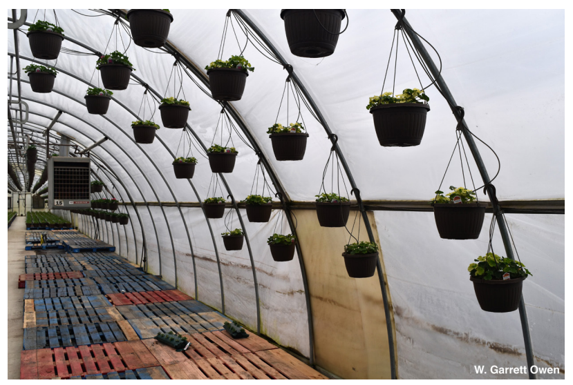
Figure 4. Primary heater mounted 12 feet away from the first bow of suspended geranium baskets.

In one case, the greenhouse where the geranium hanging baskets are being grown requires two heaters, a primary heater with a temperature set point of 65 to 68 ° F and a secondary heater with a lower set point. The primary heater was mounted 12 feet away from the first bow of suspended geranium baskets (Fig. 4).