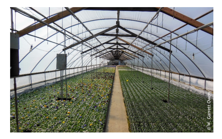
Figure 4. Installation of diagonal braces attached at the peak inside the greenhouse and at vertical supports will provide additional support to the greenhouse structure.

Other snow removal methods include snow rakes or knotted ropes. Operators that use snow rakes to pull the snow off should be