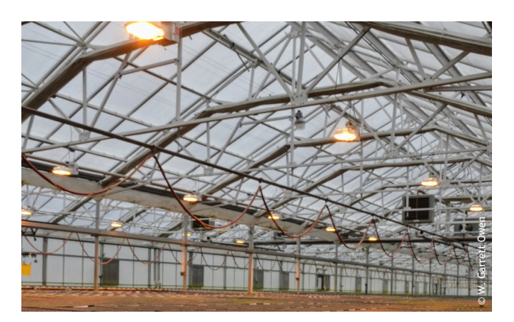
Figure 6. The most common method for melting snow in hightech glass-glazed greenhouses is to open the energy curtains.