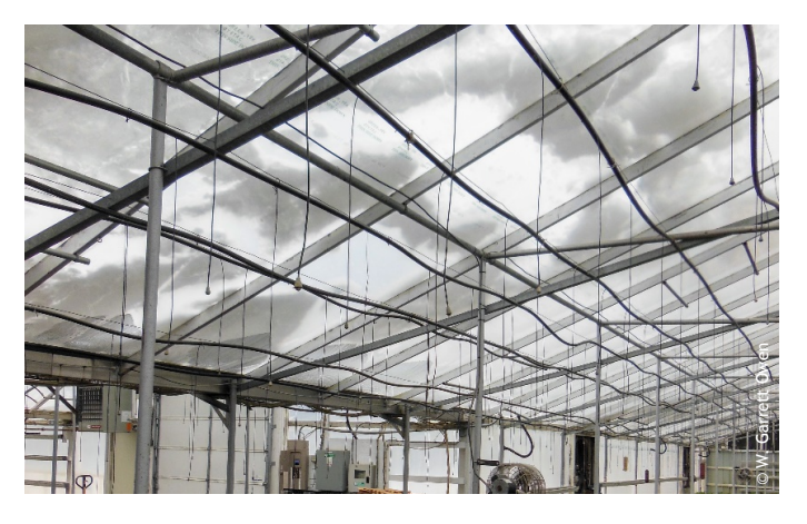
Figure 5. The greatest snow removal challenge is with double poly-covered greenhouses. Photo by W. Garrett Owen.

Figure 4. Installation of diagonal braces attached at the peak inside the greenhouse and at vertical supports will provide additional support to the greenhouse structure. Photo by W. Garrett Owen.