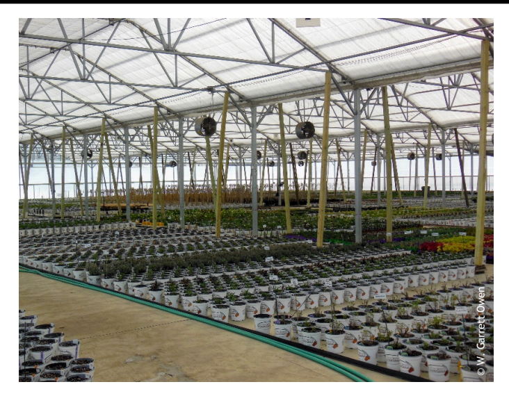
Figure 8. To provide additional support in glass-glazed greenhouses, 2' x 4's can be placed under and near gutter connections, however snow removal may still be required.

cautious to not pierce the poly or allow snow to accumulate along the sidewall. Operators who use knotted ropes can successfully remove snow from the greenhouse by pulling it across the greenhouse without damaging the single or double poly. A solid braid nylon is soft and will not damage poly, while other ropes made such as polypropylene and even nylon twist can damage poly (Barry Thoele, personal communication).