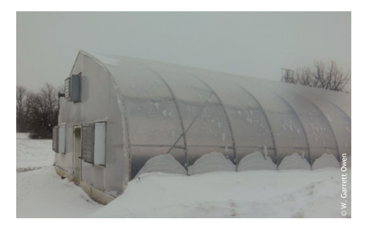
Figure 2. Avoid snow accumulation along the sidewall as it may crush it in.