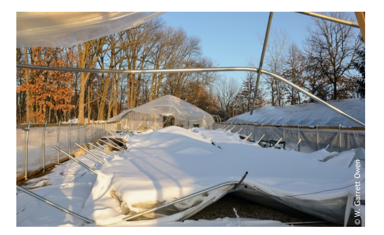
Figure 1. Heavy, wet snow accumulation on the double-poly greenhouse resulted in collapse of the greenhouse structure.

Prior to a snow event and during routine maintenance of the greenhouse structure, one should check bolts, screws and clamps on the frame for tightness. Screws and holes where screws once were in the tubing create weakness, especially at the bottom of frame this is where greenhouses likely buckle and bend when a heavy snow load falls upon the greenhouse roof. Installing diagonal braces from the peak to the baseboard at the endwall, on all four corners provides stability and keeps the frames vertical. Most free-standing greenhouse are equipped with diagonal braces and if not, consider an installation