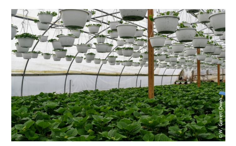
Figure 3. To provide additional support in double poly-covered greenhouses, 2' x 4's can be placed under weight bearing bow and purlin connections, however snow removal may still be required.