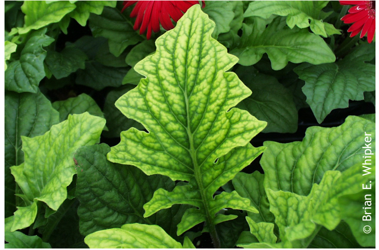
Figure 10. Gerbera can develop interveinal chlorosis on both the lower foliage (a magnesium deficiency) and the upper leaves (a high pH induced iron deficiency), so it is important to determine where on the plant symptoms are developing.