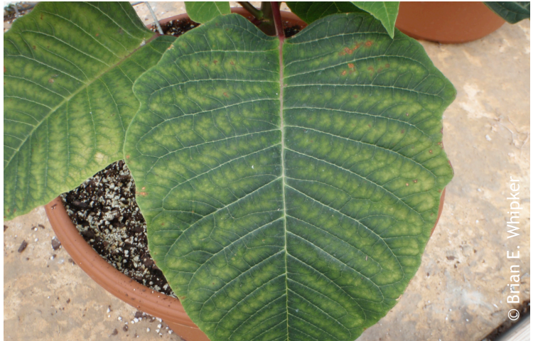
Figure 11. Lower leaf interveinal chlorosis caused by a magnesium deficiency on poinsettia.