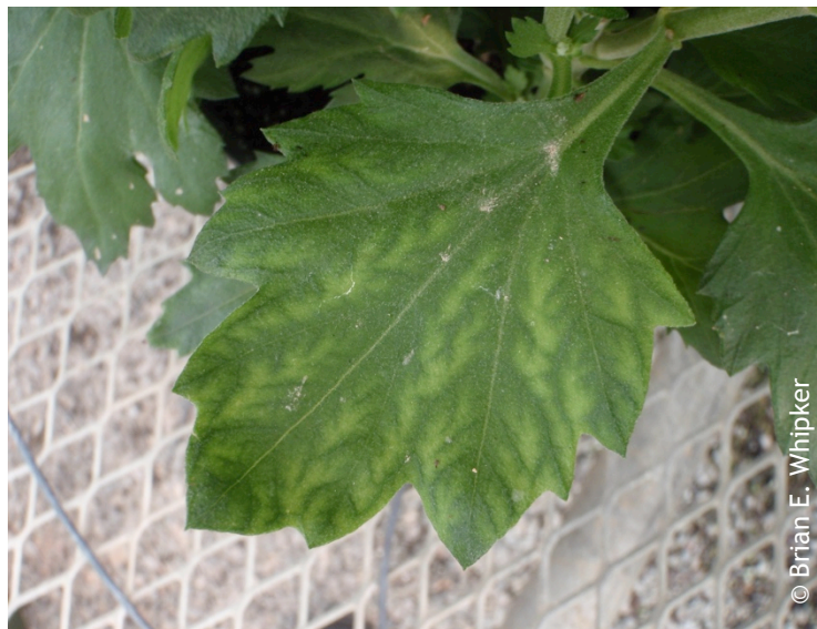
Figure 6. Initial signs of a magnesium deficiency symptoms on the lower leaves of pot mums.

added to avoid pH drop of the substrate. These elevated levels of Ca limit the uptake of Mg and plants often develop deficiency symptoms.