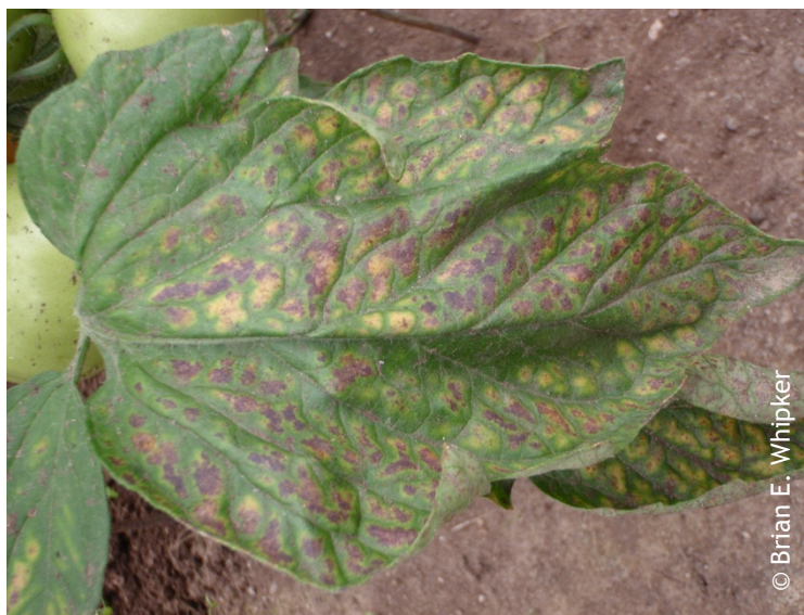
Figure 5. On tomatoes, the dark spotting is a dark purplish-black coloration. It can be confused with low substrate pH symptoms.