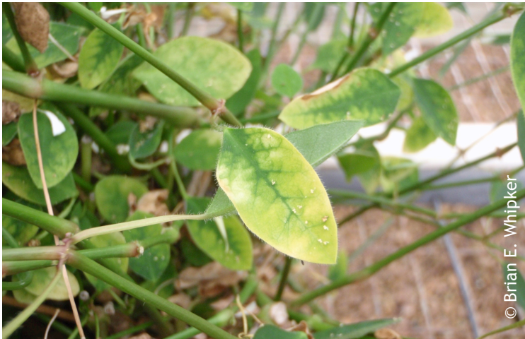
Figure 8. Advanced symptoms of magnesium deficiency on Euphorbia.