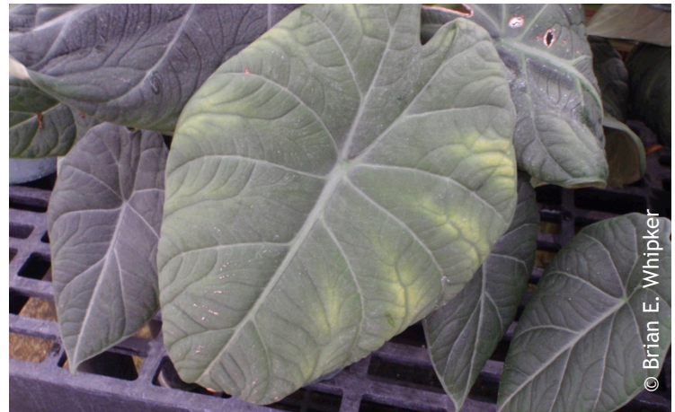
Figure 2. The initial symptom of a magnesium deficiency begins as faint interveinal chlorosis (yellowing) of the lower leaves ( Alocasia 'Maharani').

Magnesium uptake is also affected by other elements. In general the recommendation is to target a 4:2:1 ratio of potassium (K) to calcium (Ca) and Mg. This helps avoid antagonisms that limit the plant's ability to uptake adequate levels of any one of these elements. Antagonistic situations are commonly observed with crops such as tomatoes in which high levels of Ca are provided to avoid blossom end rot or with geraniums in which high levels of dolomitic limestone or flowable lime are