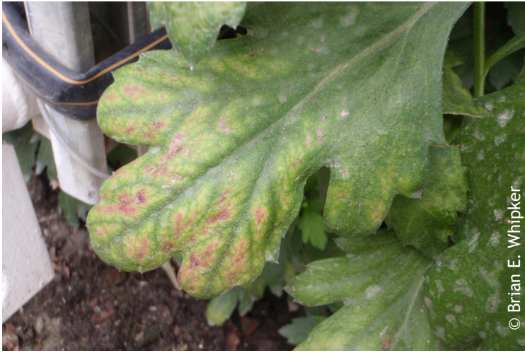
Figure 7. Advanced symptoms of a magnesium deficiency with brown (necrotic) spotting on the lower leaves of mums.