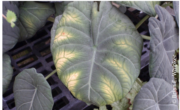
Figure 3. Interveinal chlorosis (yellowing) expands between the veins of the older leaves as magnesium deficiency symptoms progress ( Alocasia 'Maharani').