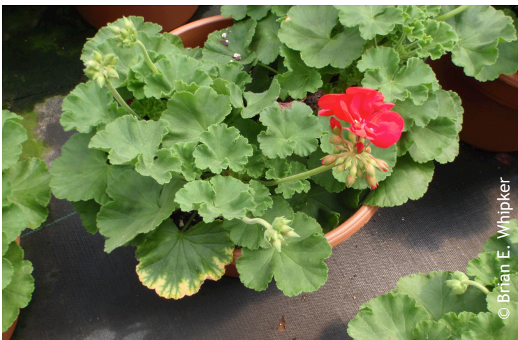
Figure 9. Geraniums often develop a magnesium deficiency as a result when excess calcium is being supplied to the crop to prevent a substrate pH drop.