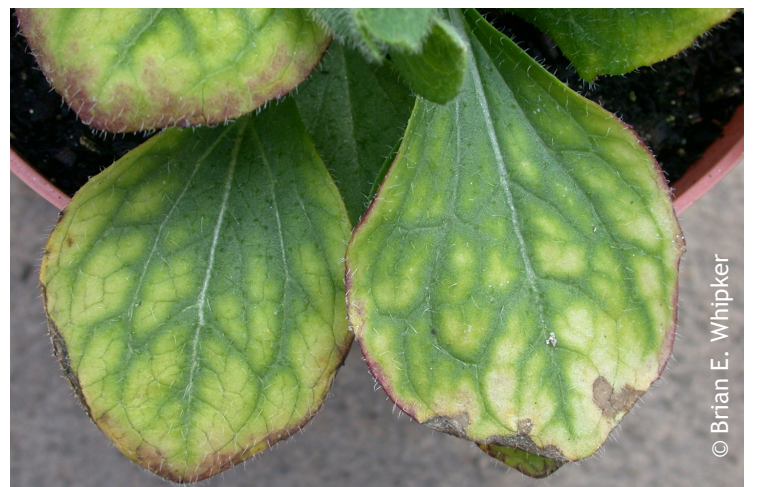
Figure 12. Rudebeckia with advanced symptoms of a magnesium deficiency.