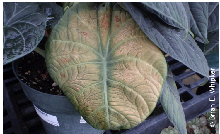
Figure 4. Brown (necrotic) spotting on the lower leaves is observed with advanced symptomatology when magnesium is deficient ( Alocasia 'Maharani').