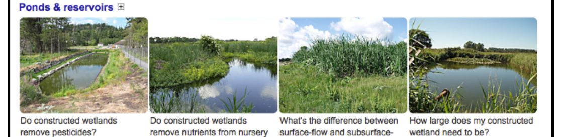
Figure 1. The Clean WateR<sup>3</sup> website provides answers to common water problems, training and tools for growers.