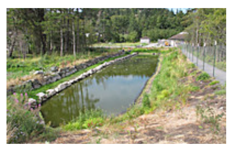
Figure 2. Constructed wetlands can be effective at removing some agrichemicals.

For example, say that you are wondering if a constructed wetland is effective at removing nutrients and agrichemicals from