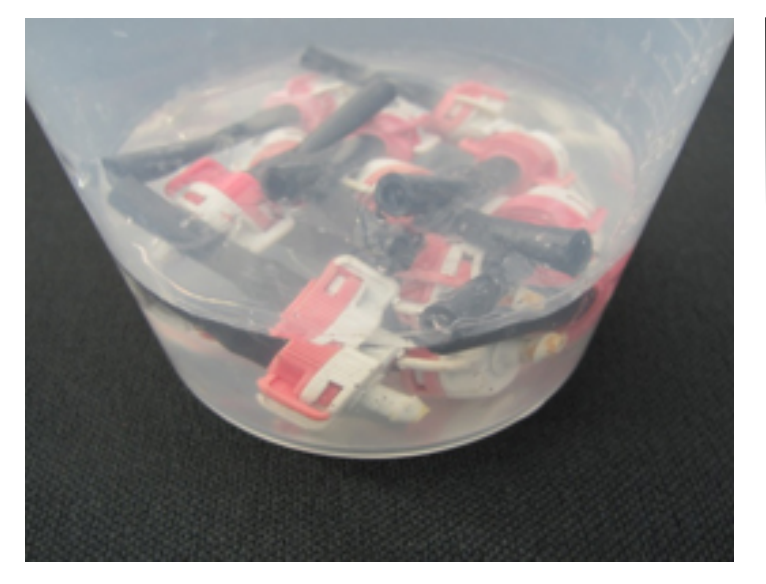
Figure 3. Irrigation emitters with biological biofilm build-up should be soaked in a dilute bleach solution.