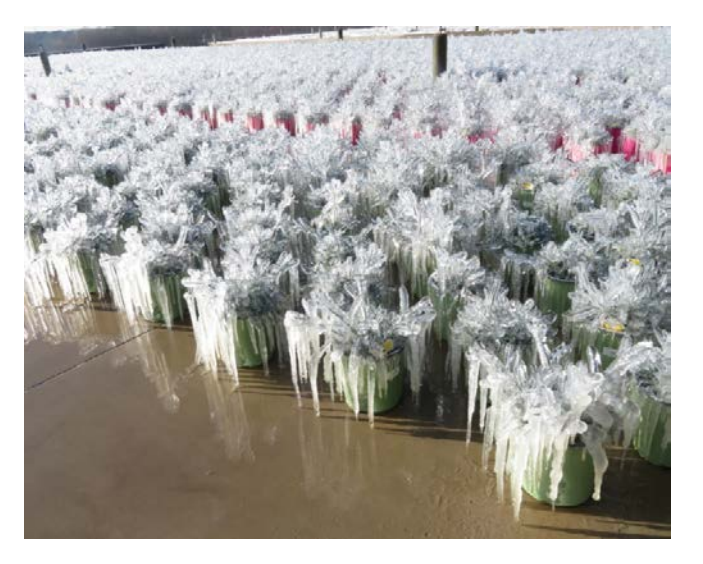
Figure 5. Sprinkling water on crops before a frost can prevent them from freezing.