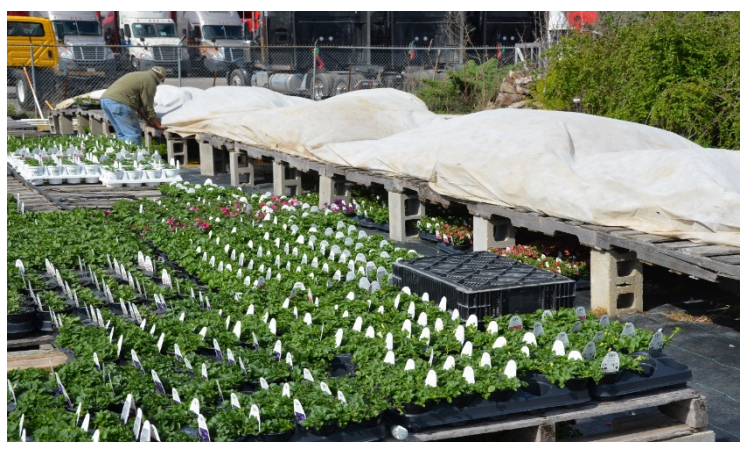
Figure 2. This grower is covering his crop with a frost cover because the temperature is forecast to reach 32 °F.

Each species has a specific minimum, optimum, and maximum temperature that influences their development rate. As you lower the temperature in the greenhouse, plants develop progressively slower. At some species-specific temperature, development stops, and this low temperature is referred to as the base temperature ( T_{\rm b} ). The T_{\rm b} can vary among species and even cultivars, and is estimated to range from roughly 30 to 54 °F (-1 to 12 °C) for the floriculture crops that have been investigated at Michigan State University (Table 1). For example, the T_h of viola is \approx 39 °F (3.9 °C), which means that at or below this temperature, a viola crop will stop growing. In contrast, vinca ( Catharanthus ) has a higher T_h of ≈53 °F (12 °C). Not surprisingly, many growers find that vinca develops very slowly when grown in the same greenhouse as a viola crop if the temperature set point is cool, such as 60 °F (16 °C).