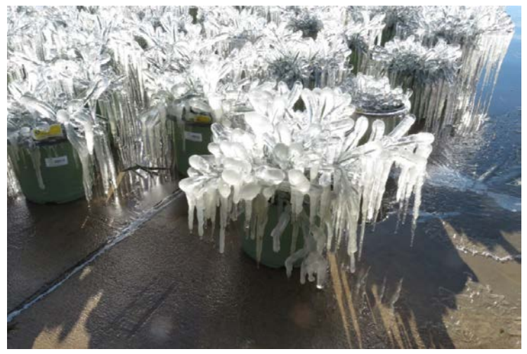
Figure 4. Sprinkling water on crops before a frost can prevent them from freezing.