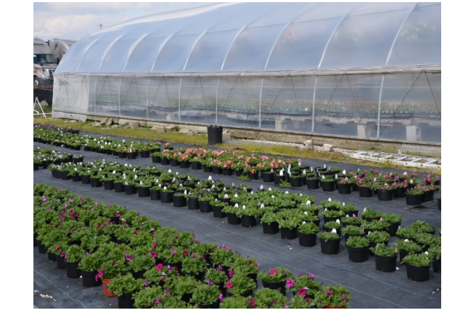
Figure 1. Cold-tolerant petunia held outdoors to make space for other crops in the greenhouse.

First, use environmental controls to slow down growth and development. If this is not possible, then a second option is using plant growth retardant (PGR) applications covered in <u>e-GRO Alert 9.20</u>. A third option is to move cold-tolerant crops outdoors, and fourth, cut back your crop. As a last resort, cut your losses and discard plants. By using low temperature versus high rates of PGRs or trimming, one can quickly turn around a plant for sale without affecting consumer experience. High rates of PGRs can last excessively long, especially when applied as a substrate drench, resulting in poor consumer performance.