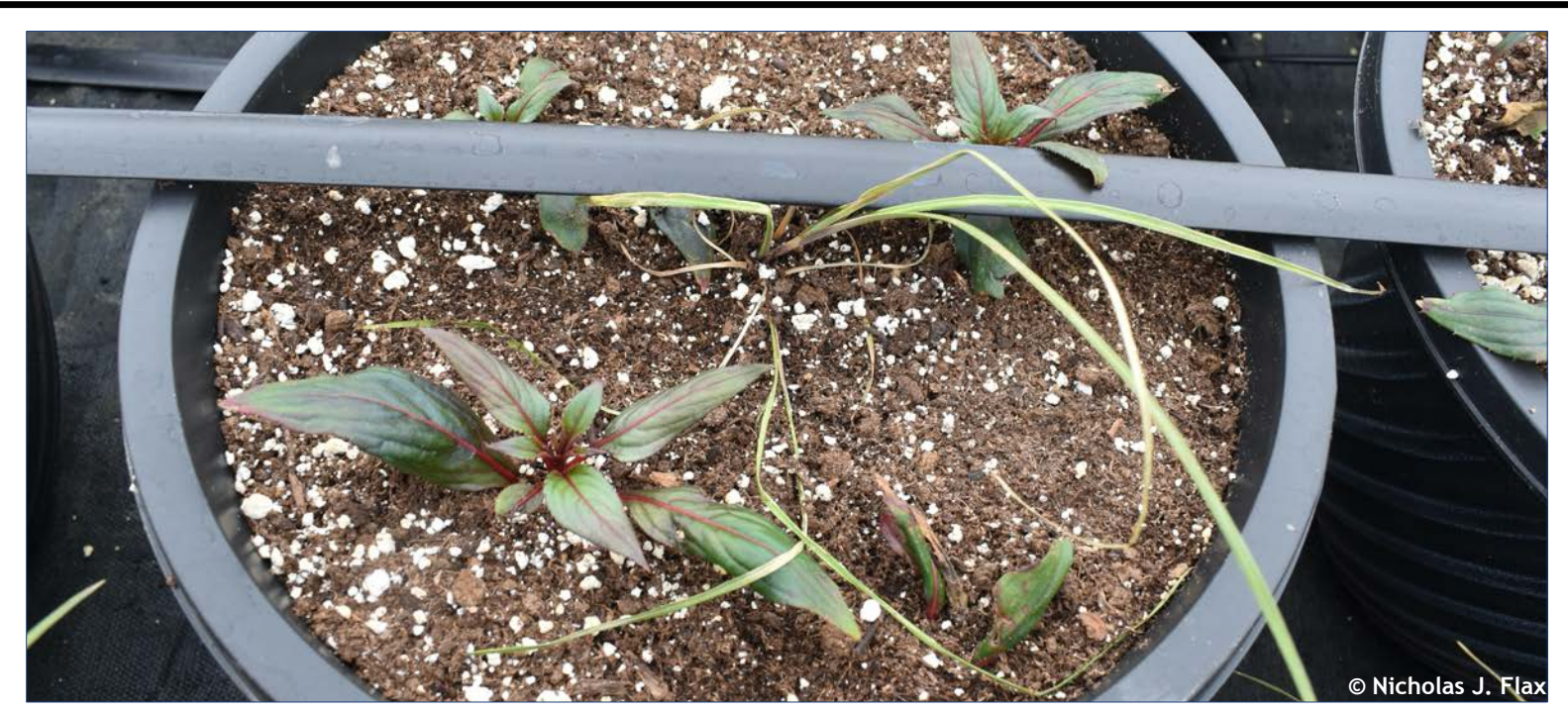
Fig. 6. These 13-inch pots were planted with four New Guniea impatiens ( Impatiens hawkeri ) and an ornamental grass ( Carex ; species unknown). In this group, anywhere from 1–3 New Guinea impatiens were mostly buried after their initial watering-in. Liners will likely die if not unburied, pots will lack uniformity, and many of these pots will become pest/disease reservoirs and be discarded.

Summary. If you are looking to save some time and labor this spring season, seek ways to tighten your belt that do not sacrifice precision and consistency on the transplanting line. Remember to take the following steps and precautions in order to avoid crop issues due to mismanaged transplanting: