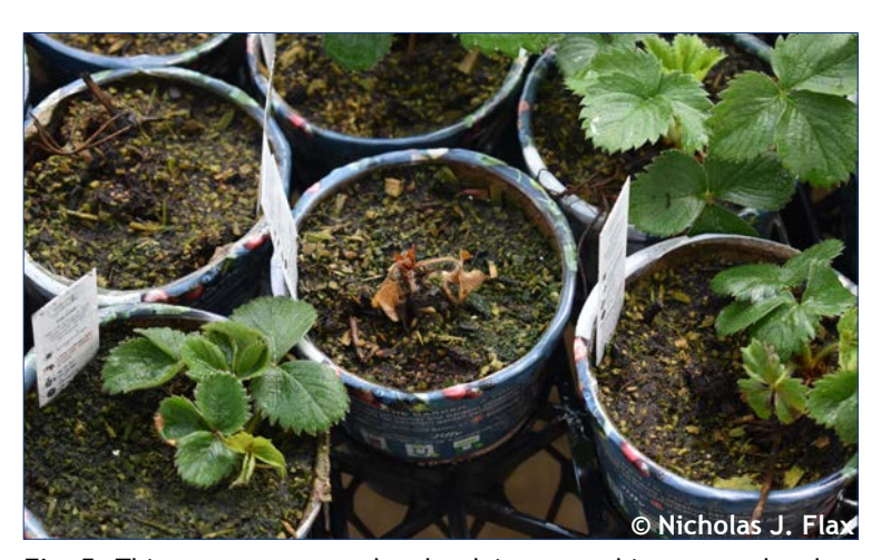
Fig. 5. This grower appeared to be doing everything correctly when their crew planted these strawberry ( Fragaria spp. ) crowns. However, by the time these newly transplanted strawberries reached the greenhouse and were watered-in, many of these plants were buried. As a result, fungal pathogens began causing disease, and many of these plants were dead or dying in their containers within a week of transplanting.