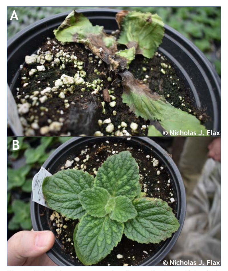
Fig 4A & B. After containers for these calceolaria ( Calceolaria hybrida ) were filled, transplanting duties were delegated to two transplanting crews (#1 & 2). Crew #1 dibbled (formed holes in which to transplant liners) much deeper than Crew #2. As a result, many of the liners transplanted by Crew #1 died due to pathogen infection on the buried portion of the stem (Fig. 4A). The group of plants handled by Crew #2, which were dibbled and transplanted appropriately, resulted in healthy, uniform plants (Fig. 4B).