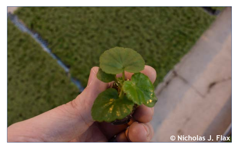
Fig. 2. If young plants are over-fertilized during later stages of production, the resulting lush, tender growth can predispose young plants to damage during transplant. These zonal geranium ( Pelargonium \times hortorum ) plugs were fed heavily to push growth and keep them on schedule but were very tender and broke easily during transplant. Inform transplant teams if extra care is needed to handle plugs or liners in order to reduce post-transplant crop losses.