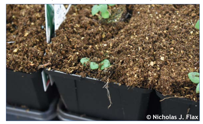
Fig. 3. These snapdragon ( Antirrhinum majus ) plugs were planted into containers filled with more substrate than needed. As a result, many of these plugs were partially buried even before they reached the end of the conveyor belt. Many of these seedlings will not survive if left covered.