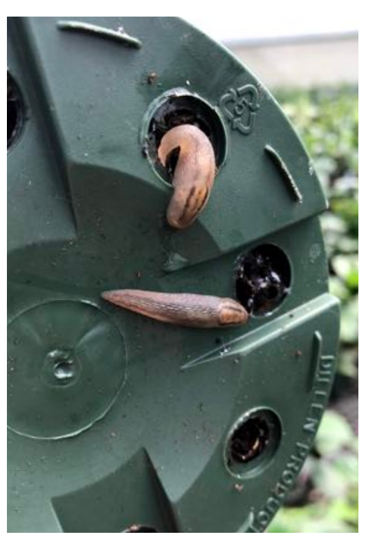
Figure 6. Slugs can be found in the interior plant canopy or at the bottom of the pot.