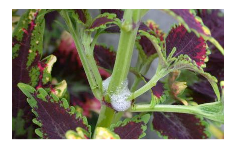
Figure 9. Spittlebugs are mainly only a pest in landscape plantings.