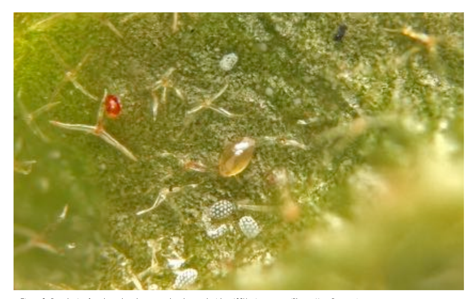
Figure 2. Broad mite female and oval eggs can be observed with a 100X microscope.