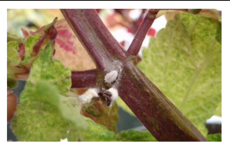
Figure 7. White insects on coleus usually denote a mealybug infestation. (Photo: Brian Whipker)

Spittlebugs are typically a pest of landscape plants. The immature insect can be found in the protective spittle (Fig. 9). (Photo: Brian Whipker)