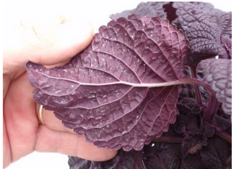
Figure 10. Western flower thrips may only feed on the lower leaf surface, thus making detection a challenge.