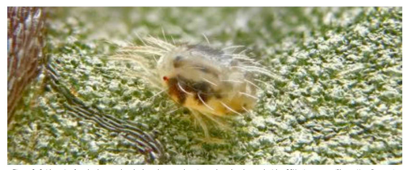
Figure 8. Spider mite females have a clear body and a tan coloration and can be observed with a 20X microscope.