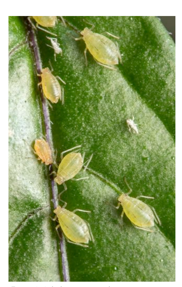
Figure 1. Aphids are reported as a pest problem on coleus.

In addition, e-GRO authors have observed Western flower thrips, spittlebugs, caterpillars, and slugs on coleus.