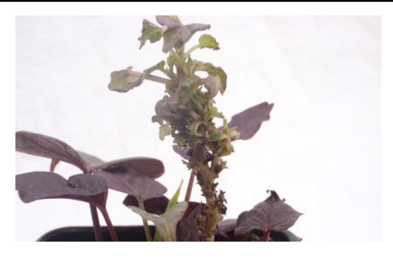
Figure 3. Distorted new growth is the typical symptom of a broad mite infestation, as seen here on ornamental ipomoea.

While broad mites infestations are uncommon on coleus. Most likely, problems are more prevalent when growers retained their own stock plants from year-to-year, which allowed for a build up of broad mites. Another common instance is when infested hanging baskets are suspended above a crop and the pest fall to the crop below. Nonetheless, broad mites are very small and require 100X magnification to view (Fig. 2). Broad mites cause the new growing tip to become distorted and hard (Fig. 3).