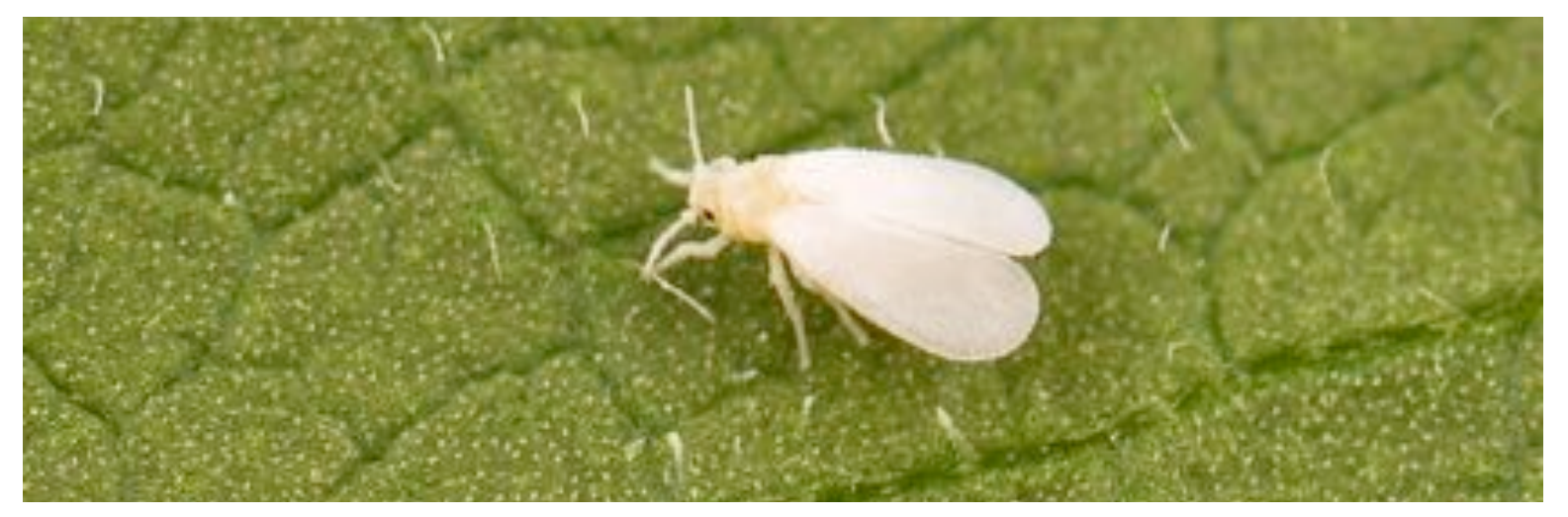
Figure 11. An adult whitefly is easy to see on most plant leaves.