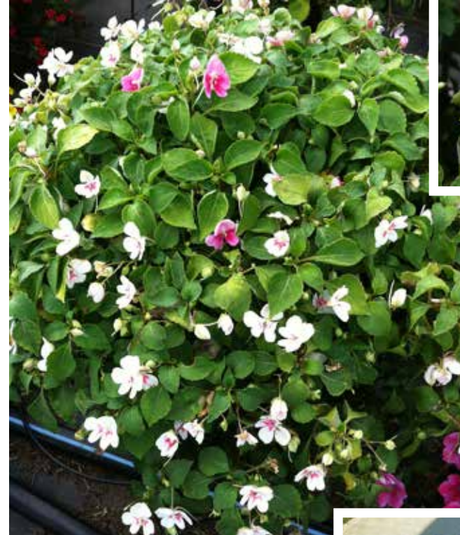
right: Leaf drop caused by impatiens downy mildew.

Where trade names, proprietary products, or specific equipment are listed, no discrimination is intended and no endorsement, guarantee or warranty is implied by the authors, universities or associations.