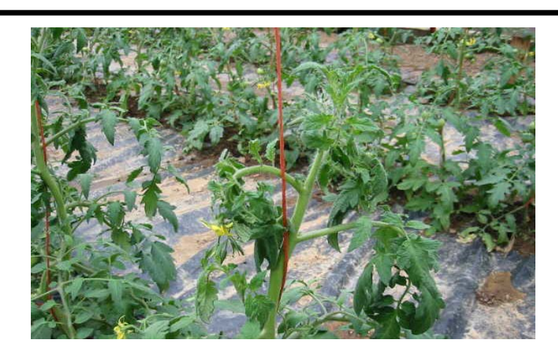
Downward bending of tomato stems is described as epinasty. This grower installed an unvented gas furnace in a new greenhouse. Its prompt replacement eliminated the ethylene issue resulting in normal yields.