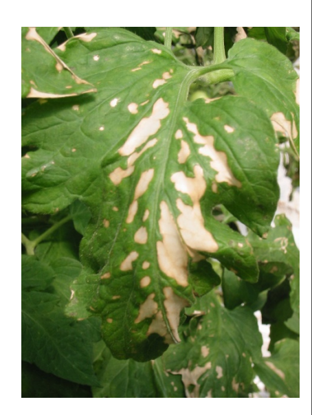
Sulfur dioxide injury is characterized by interveinal necrosis in tomatoes.

Ethylene is the most subtle, but perhaps the most injurious of the flue gases. Ethylene can pass through the smallest of holes on the flue pipe or through holes in the heat exchangers into the growing area.