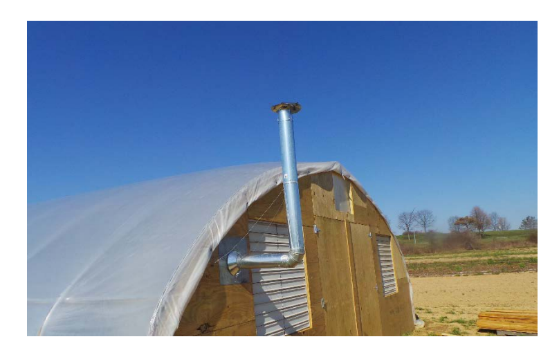
The flue pipe extends over the roof line by several feet and ahs a cap in place to prevent flue gases from being blown down the pipe into the greenhouse.