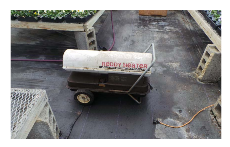
Even the temporary use of unvented heaters on a cold night can create cropping problems in greenhouses and high tunnels.