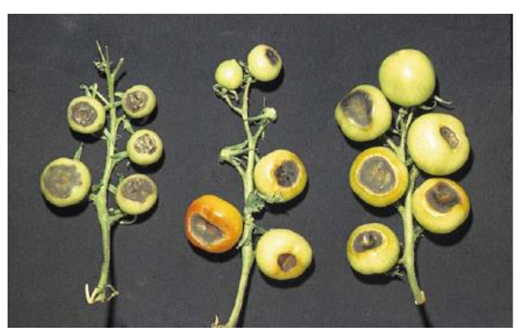
Figure 1. Calcium deficiency in tomato fruits caused by blossom-end-rot. Photo from Sonneveld and Voogt (2009).

Insufficient calcium transport can lead to BER in fruits even when sufficient amounts of calcium are supplied in the nutrient solution. Increasing the transport of calcium to fruits can solve the problem of BER, but going too far can lead to symptoms of "spot" because of the tendency for calcium to accumulate near the top of the fruit.