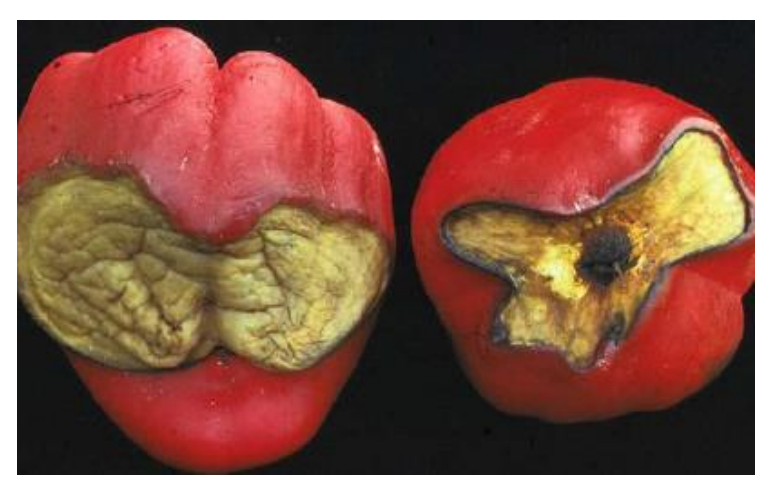
Figure 2. Blossom-end-rot in sweet pepper.