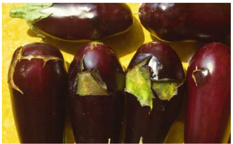
Figure 3. Calcium deficiency in eggplant fruits is characterized by soft spots at the lower part of the fruits.