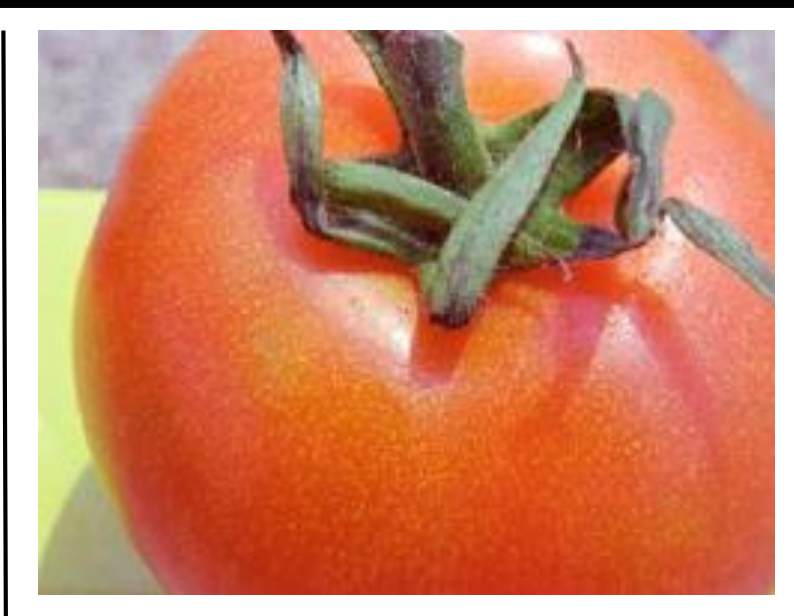
Figure 5. Gold specks on tomato fruit connected with high calcium concentrations in the upper part of the fruit.

Blossom-end-rot and "spot" can be difficult to diagnose from tissue nutrient analysis because of how calcium is transported and because deficiency/toxicity is highly localized in very specific parts of the fruit. Symptoms occur even when concentrations are adequate in leaves, and critical nutrient thresholds in plant tissues depend on multiple environmental/cultural factors making interpretation difficult.