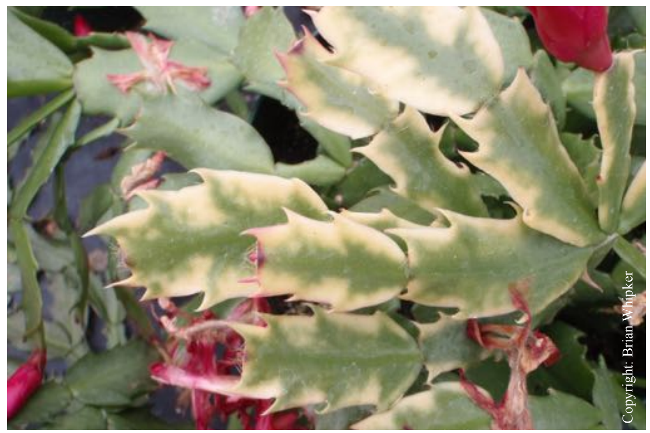
Figure. 4. Overview of a plant with low pH induced iron and manganese toxicity.