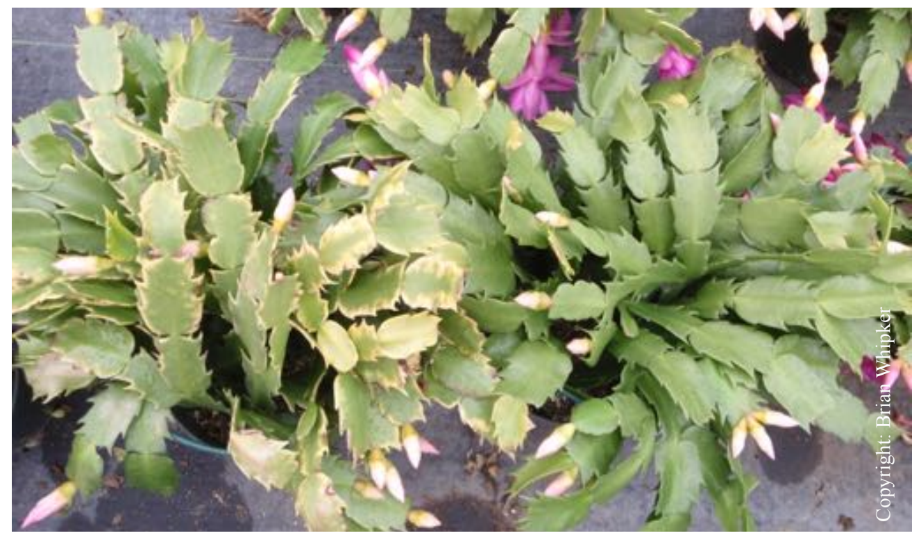
Figure. 5. Sympotoms did not readily develop on all cultivars (plant on right).