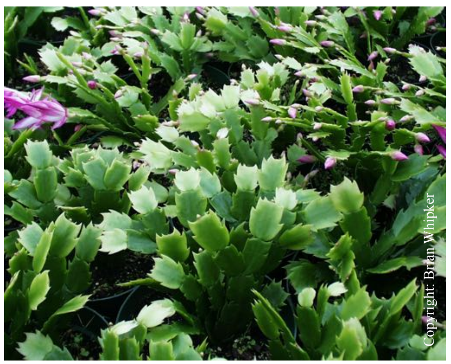
Figure. 3. Young phylloclade having chlorois (interveinal chlorosis) due to an elevated substrate pH above 6.5.

For most floriculture crops, low pH problems begin to occur at levels lower than 5.4, with the majority of symptoms being evident at pH 4.8 or lower. Therefore I am in agreement with increasing the lower recommended range. Rarely are symptoms of low substrate pH induced iron and manganese toxicity occurring at pH 5.8. I have observed elevated substrate pH induced iron (Fe) deficiencies when the pH is above 6.5, so in my opinion the upper target limit for the substrate pH should be <6.3. Therefore, when conducting in-house pH testing of Christmas cactus, the recommended pH range can be slightly wider and be between 5.8 and 6.3. When the substrate pH enters the range of 0.2 pH units lower or higher of the optimum is when corrective procedures should be implemented.