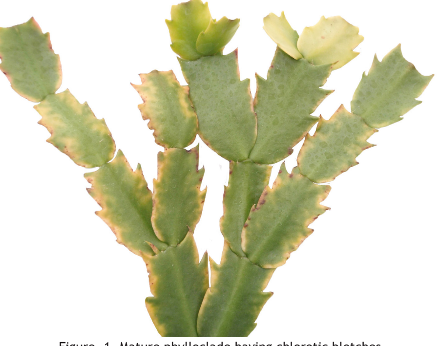
Figure. 1. Mature phylloclade having chlorotic blotches.