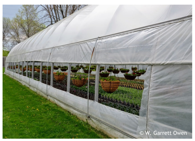
Figure 4. High tunnel with roll down sidewalls.