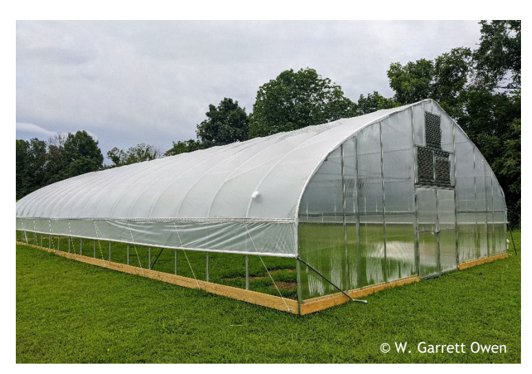
Figure 3. Example of a high tunnel which is glazed with a single layer of polyethylene and lacks a heater and exhaust and horizontal air flow fans.