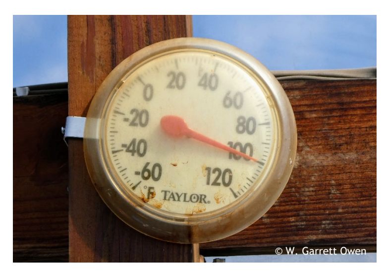
Figure 6. A thermometer displaying high temperatures within a closed high tunnel.