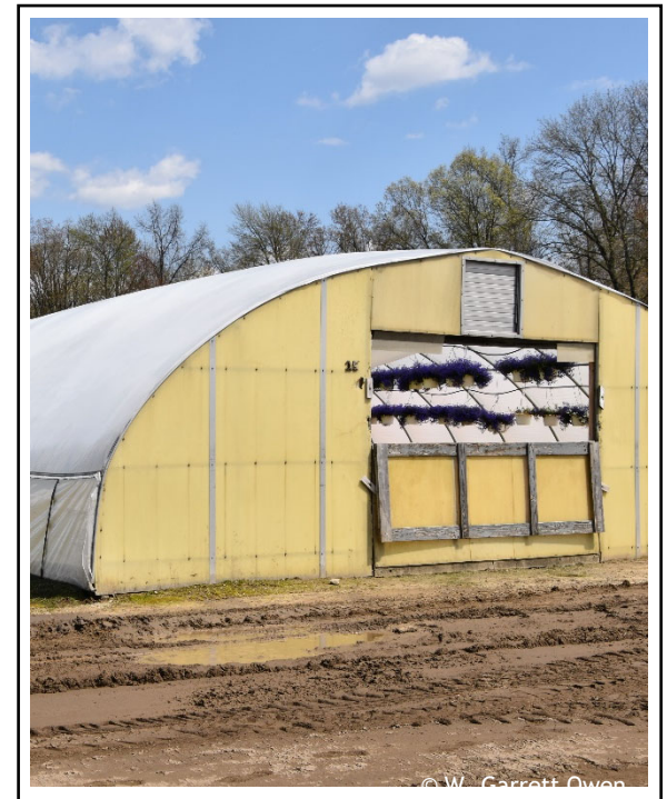
Figure 1. Example of an unheated high tunnel used for bedding plant production.

Bedding plants are commonly grown in greenhouses equipped with environmental controls used to manage and manipulate temperature, humidity, and light. While not all greenhouses may be outfitted with horticultural lights, most if not all contain heaters and exhaust fans utilized to heat and cool the growing environment. Advantages of heating and cooling the growing environment allow growers to control the rate of crop development such as leaf unfolding or the progression toward