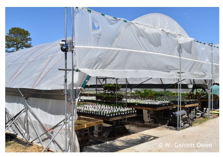
Figure 2. Example of a modified haygrove used for bedding plant production.