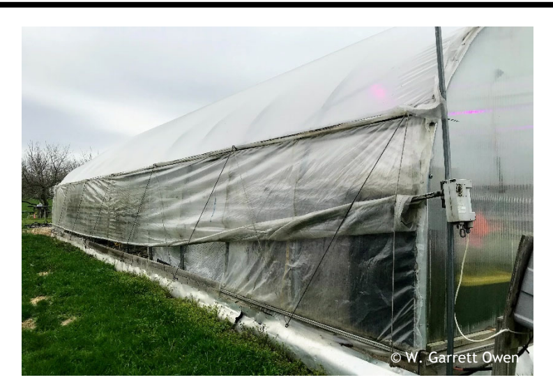
Figure 5. High tunnel where the motorized sidewall crank system failed to open.