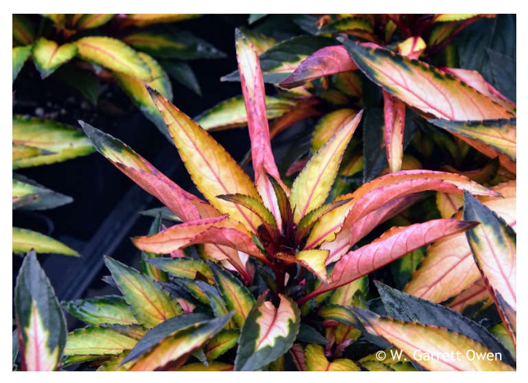
Figure 7. A New Guinea impatiens crop exhibiting leaf rolling because of heat stress.